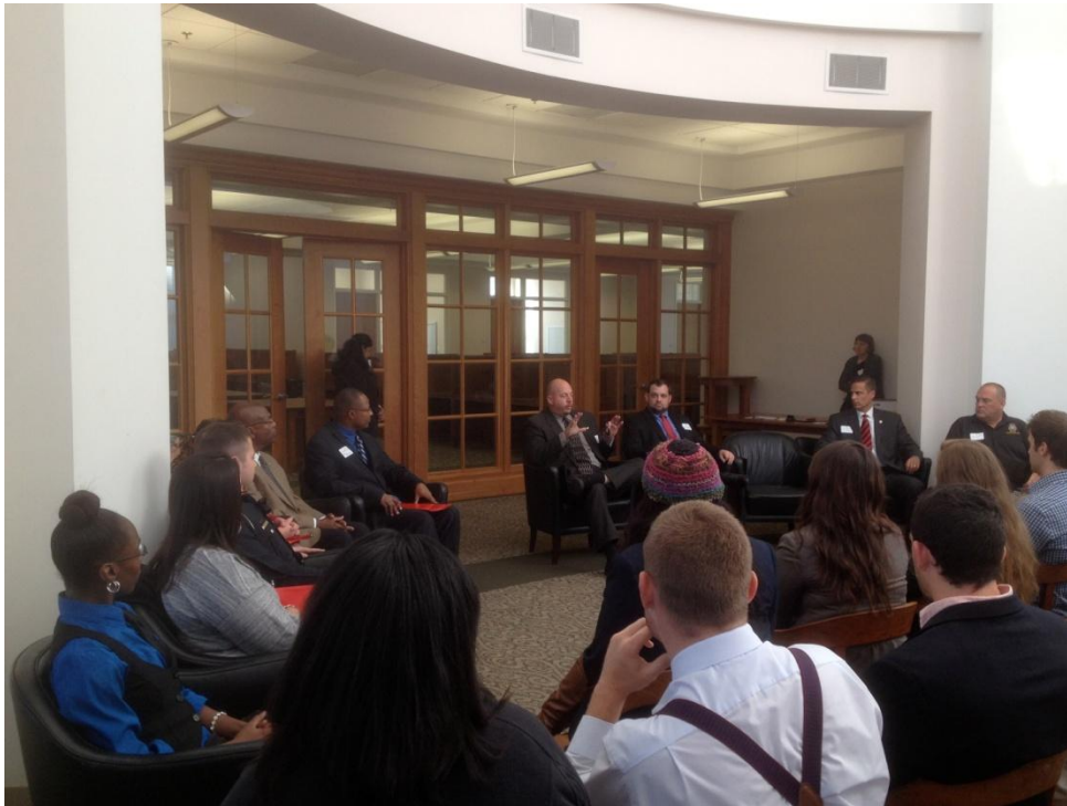
2013 CRIMINAL JUSTICE STUDIES PROGRAM ALUMNI PANEL